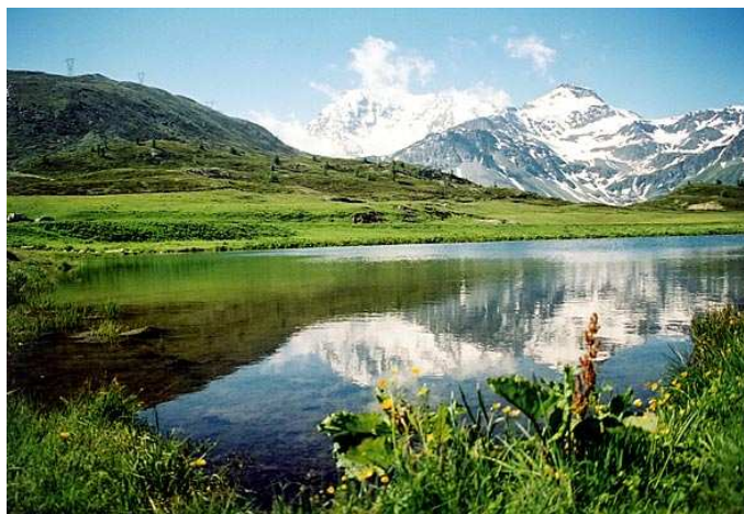
Photo of the lake in the Swiss alps near the Simplon mountain pass.